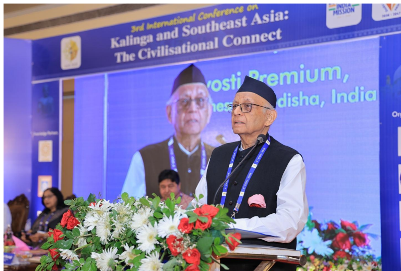
Amb Lalit Mansingh delivering the Keynote Address at the International Conference on Kalinga and South East Asia in Bhubaneswar on 24 th May, 2025.

Amb Mansingh was the Chief Guest at the inaugural function and delivered the Keynote Address. He also gave the Valedictory Address on 25 th May, 2025.